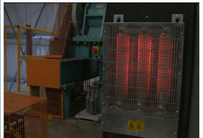
Before: Excess Energy Lost Through Braking Resistors