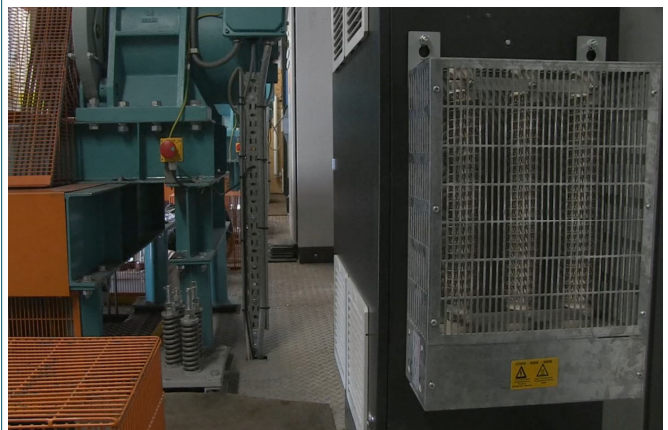
After: Braking Resistors Showing Reduced Loss Of Energy Now Stored By Green Gem